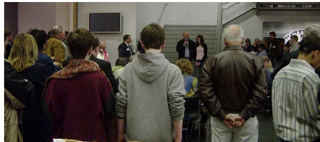
Donors listen to the evening's speakers.